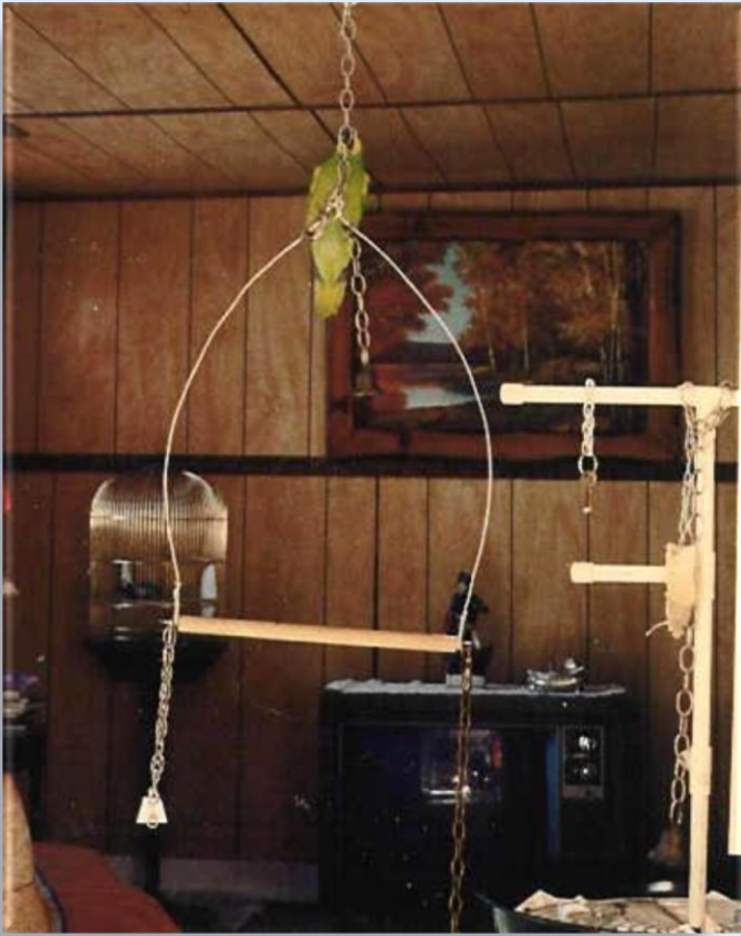
Barbara at the top of the swing